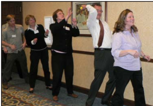
Fun & Games for profit and fun.

A huge thank you to all of our sponsors, speakers and facilitators that made our first meeting of the year a great success.