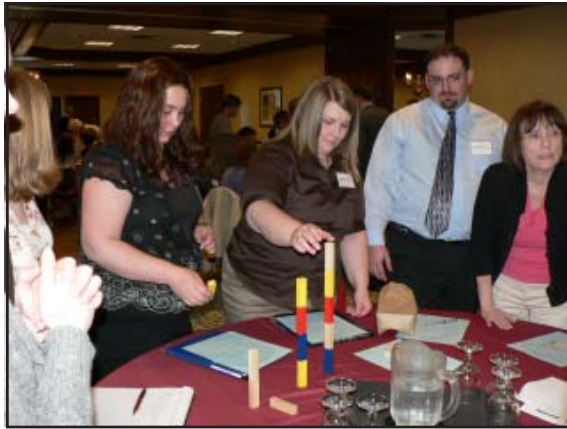
22 TEA member companies were represented with a total number of 80 attendees.

Sharing Bright Ideas was the theme of our Spring Conference held in Pewaukee on April 18th. The meeting was sponsored by Crowe Chisek, Enterprise Services, Principal Financial Group, and Kretz Lumber Company.