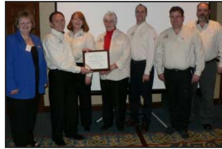
WI ESOP Company of the Year Industrial Electric Wire & Cable