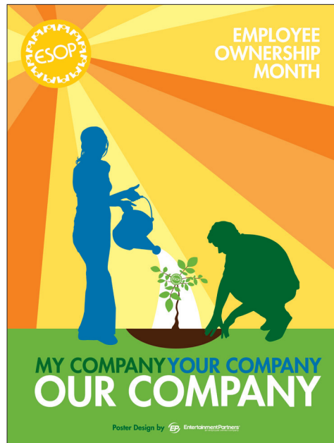
2010 Entertainment Partners Burbank, CA