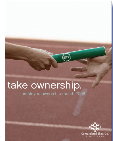
2008 Consolidated Shoe Co., Inc. Lynchburg, VA