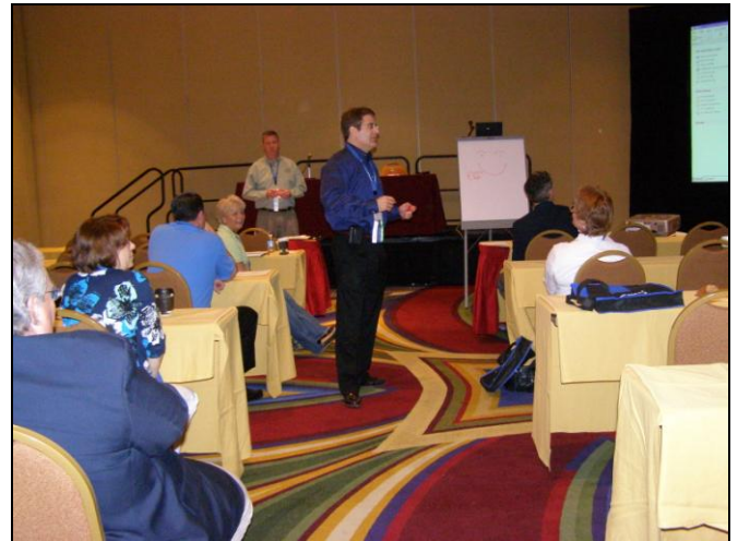
More from the MAC Chapter Meeting