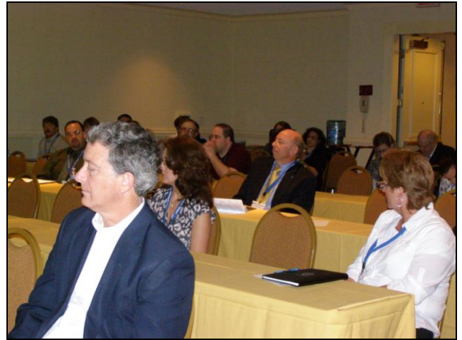
MAC chapter members