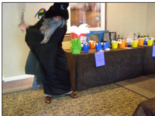
Dangalf the (Duffer?)Dapper Warming up for the Annual Fall Golf Outing, October 6