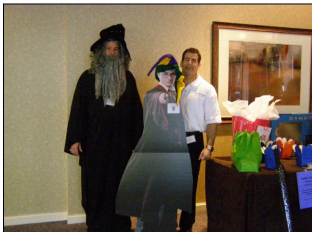
Participants enter the magic realm guided by the Mid-Atlantic wizards and sorcerers