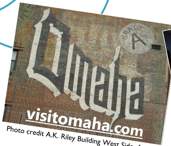
Building West Side, Asten